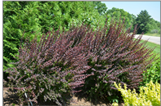
Sunjoy Syrah Japanese Barberry

Sunjoy Syrah Japanese Barberry is recommended for the following landscape applications;