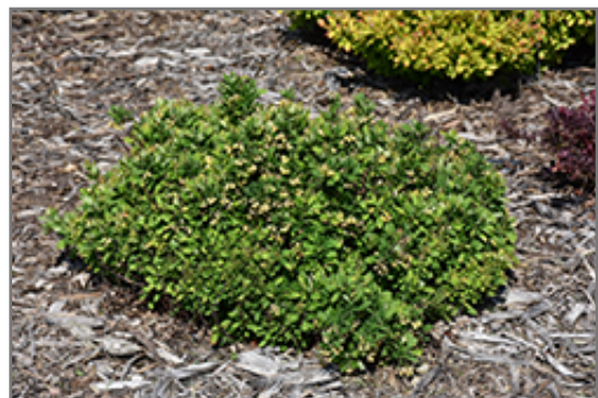
Moscato Barberry