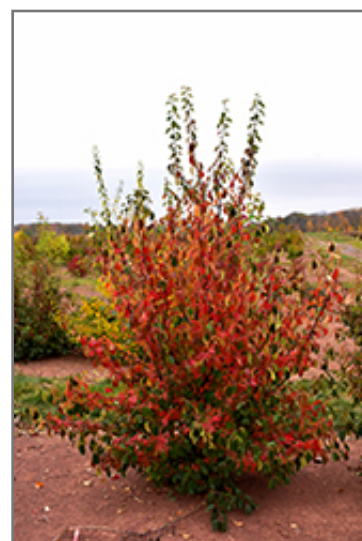
Chinese Quince in fall