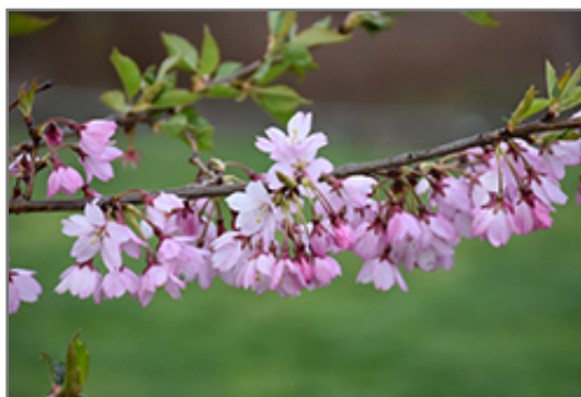
Whitcomb Higan Cherry flowers