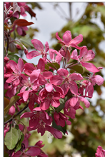
Royal Mist Flowering Crab flowers