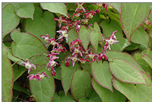
Bishop's Hat flowers

This plant will require occasional maintenance and upkeep, and is best cleaned up in early spring before it resumes active growth for the season. It is a good choice for attracting bees to your yard, but is not particularly attractive to deer who tend to leave it alone in favor of tastier treats. Gardeners should be aware of the following characteristic(s) that may warrant special consideration;