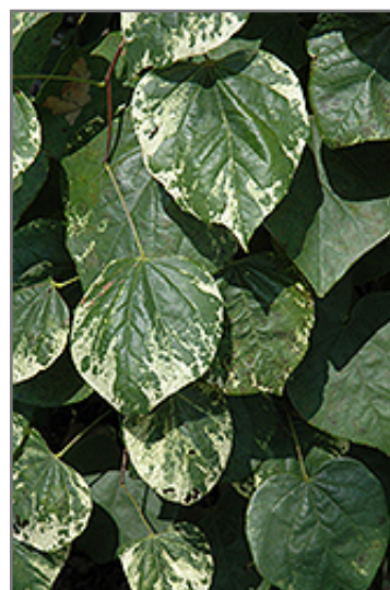
Whitewater Redbud foliage