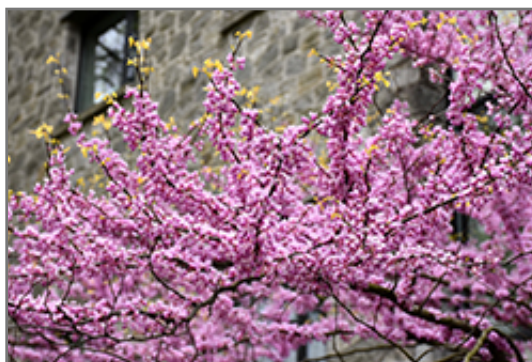
Solar Eclipse Redbud flowers