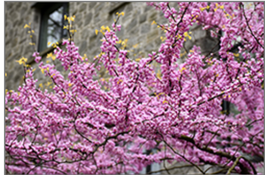
Solar Eclipse Redbud flowers