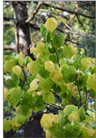
Solar Eclipse Redbud foliage

This plant is not reliably hardy in our region, and certain restrictions may apply; contact the store for more information.