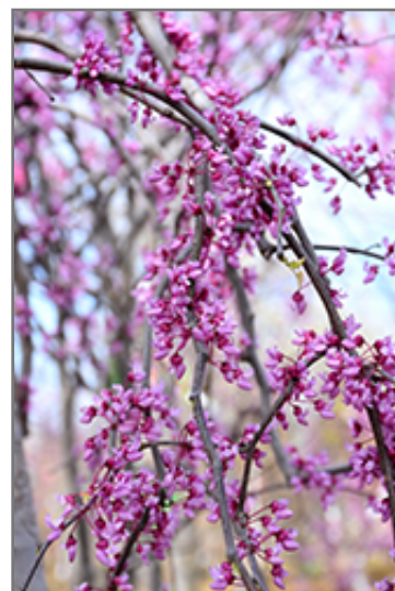
Pink Heartbreaker Redbud flowers