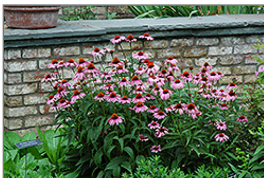
Magnus Coneflower in bloom