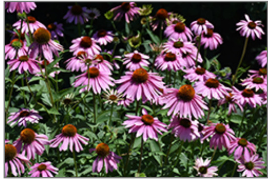
Magnus Coneflower flowers

Magnus Coneflower will grow to be about 24 inches tall at maturity extending to 3 feet tall with the flowers, with a spread of 24 inches. It grows at a medium rate, and under ideal conditions can be expected to live for approximately 10 years. As an herbaceous perennial, this plant will usually die back to the crown each winter, and will regrow from the base each spring. Be careful not to disturb the crown in late winter when it may not be readily seen!