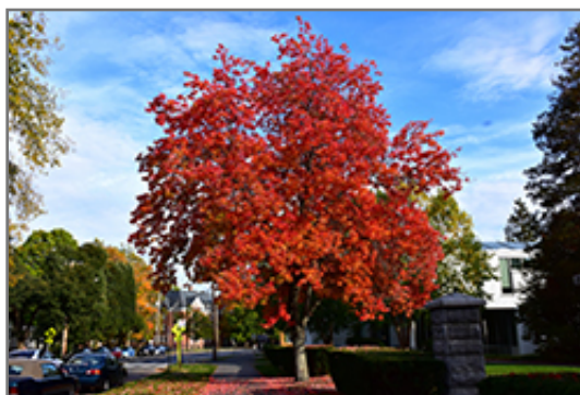
Red Maple in fall