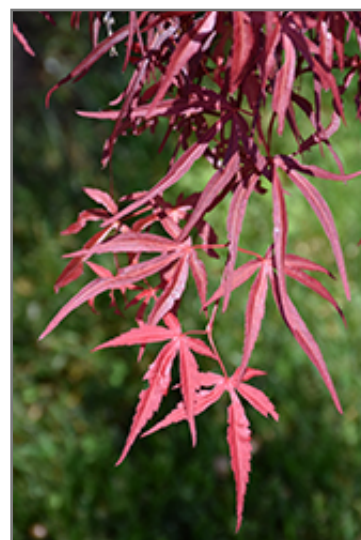
Red Spider Japanese Maple foliage