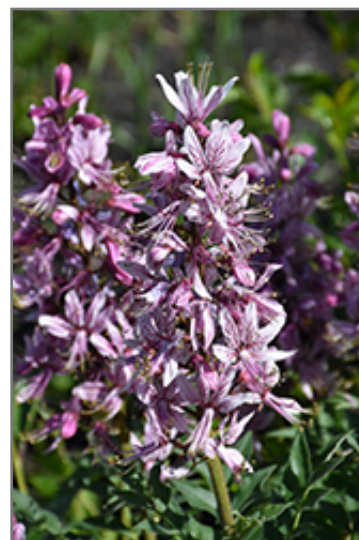
Pink Gas Plant flowers