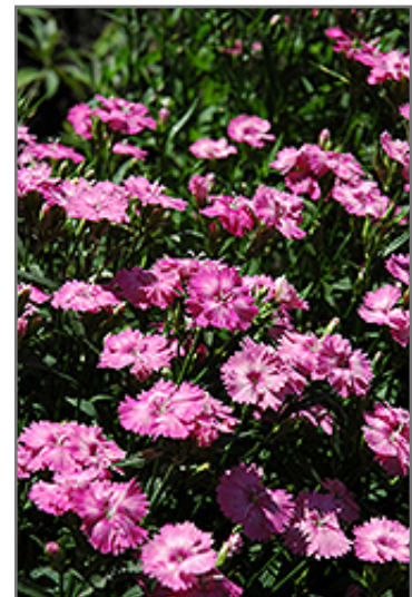
Blue Hills Pinks flowers