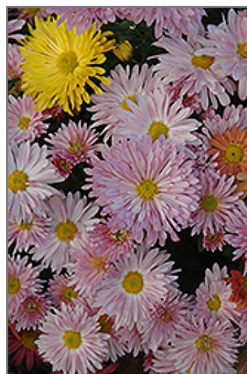
Centerpiece Chrysanthemum flowers