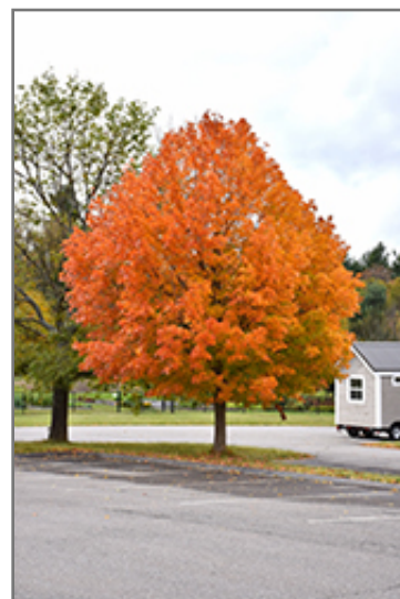
Sugar Maple in fall