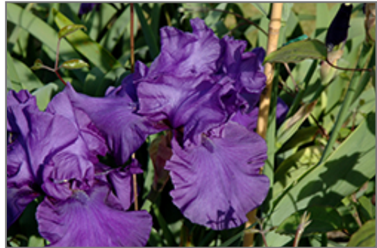
Blueberry Bliss Iris flowers