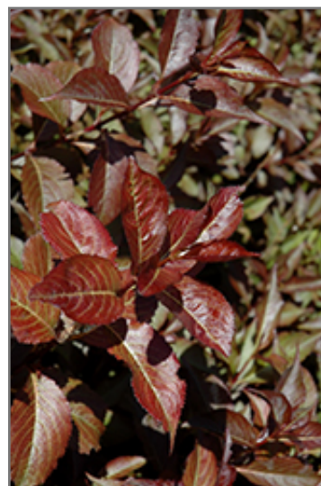
Naomi Campbell Weigela foliage