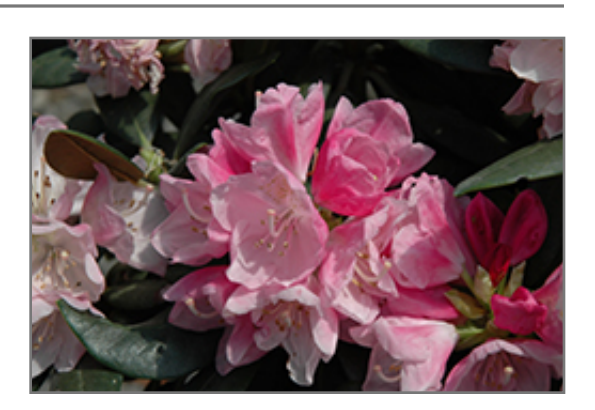
Hachmann's Polaris Rhododendron flowers

Hachmann's Polaris Rhododendron will grow to be about 4 feet tall at maturity, with a spread of 4 feet. It tends to be a little leggy, with a typical clearance of 1 foot from the ground. It grows at a slow rate, and under ideal conditions can be expected to live for 40 years or more.