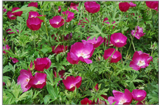
Buffalo Poppy flowers