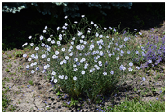
Blue Sapphire Perennial Flax in bloom