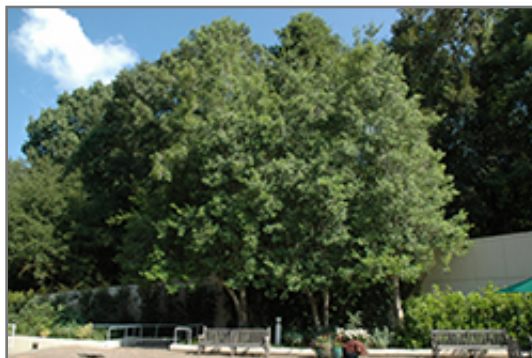
East Palatka Holly