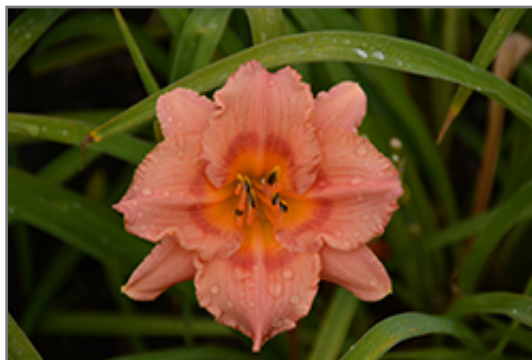
Miss Tinkerbell Daylily flowers