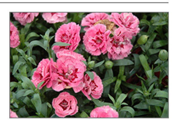
Oscar Pink And Purple Carnation flowers

Fully double pink and purple miniature carnations on short stems and compact plants; blooms consistently over a long season, especially in warmer climates; great for border fronts, containers, and floral arrangements