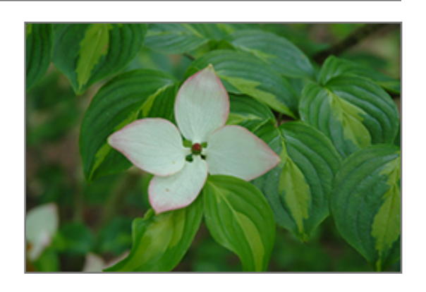
Gold Cup Chinese Dogwood flowers