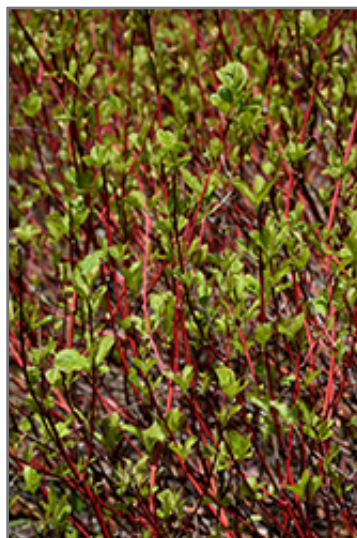
Westonbirt Dogwood stems