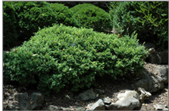
Grace Hendrick Phillips Boxwood