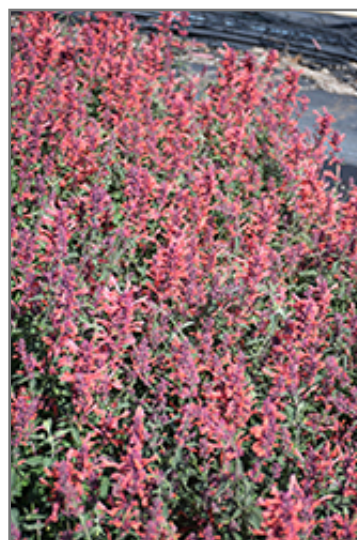
Kudos Coral Hyssop in bloom