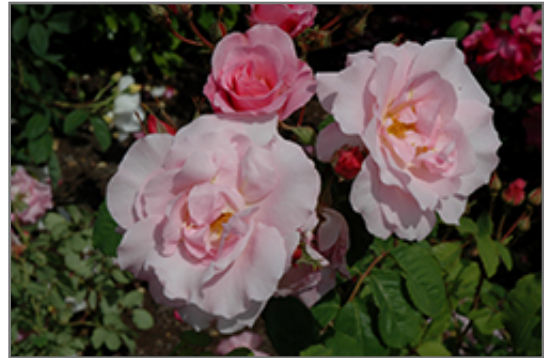
Nymphenburg Rose flowers