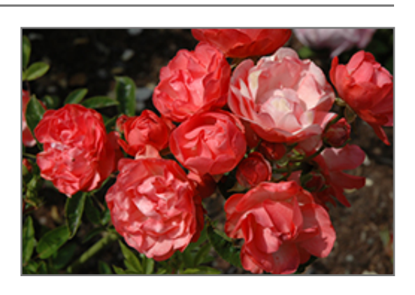
Margo Koster Rose flowers