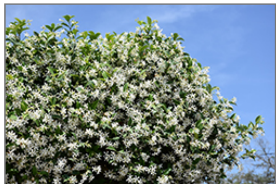
Madison Star-Jasmine flowers