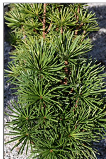
Green Star Umbrella Pine foliage