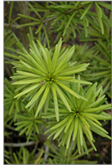
Green Star Umbrella Pine foliage

This plant is not reliably hardy in our region, and certain restrictions may apply; contact the store for more information.