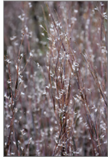
Standing Ovation Bluestem fruit

This plant should only be grown in full sunlight. It is very adaptable to both dry and moist locations, and should do just fine under typical garden conditions. It is considered to be drought-tolerant, and thus makes an ideal choice for a low-water garden or xeriscape application. It is not particular as to soil type or pH. It is somewhat tolerant of urban pollution. This is a selection of a native North American species. It can be propagated by division; however, as a cultivated variety, be aware that it may be subject to certain restrictions or prohibitions on propagation.