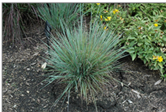
Standing Ovation Bluestem