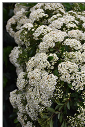
Mohave Firethorn flowers