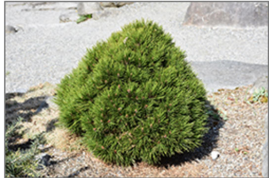
Smidt's Bosnian Pine