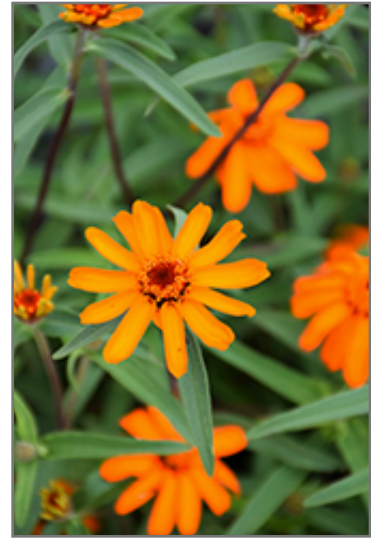
Star Orange Zinnia flowers