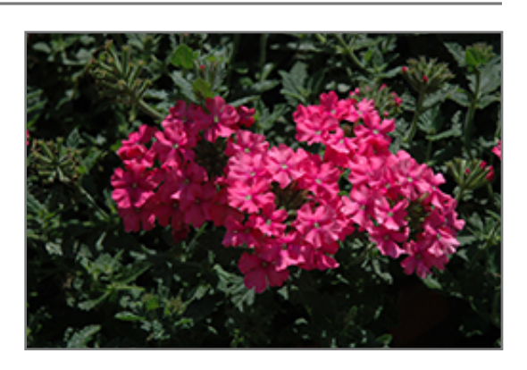
Vanessa Deep Pink Verbena flowers