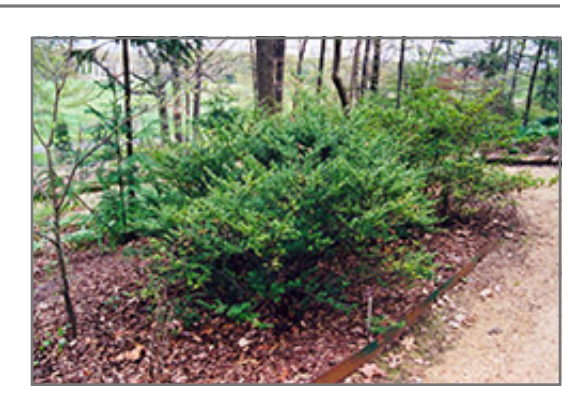
Japanese Holly