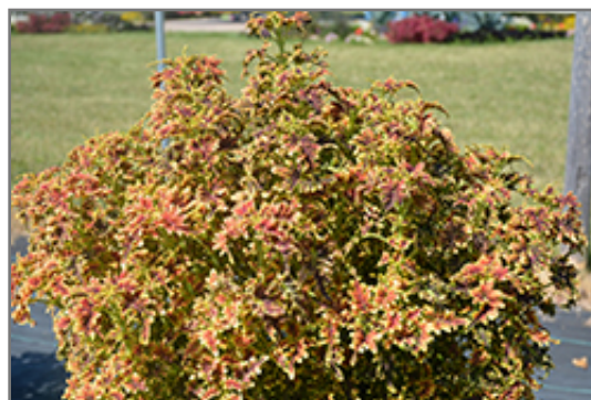
Under The Sea Copper Coral Coleus