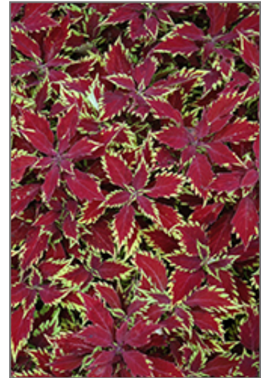
ColorBlaze Royale Apple Brandy Coleus foliage