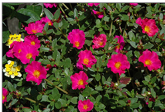
Mojave Fuchsia Portulaca flowers