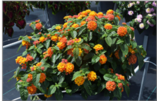
Lucky Flame Lantana in bloom

Lucky Flame Lantana is a fine choice for the garden, but it is also a good selection for planting in outdoor containers and hanging baskets. It is often used as a 'filler' in the 'spiller-thriller-filler' container combination, providing a mass of flowers against which the thriller plants stand out. Note that when growing plants in outdoor containers and baskets, they may require more frequent waterings than they would in the yard or garden.