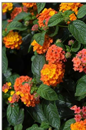
Lucky Flame Lantana flowers