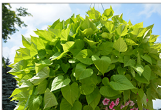
Sweet Caroline Sweetheart Lime Sweet Potato Vine