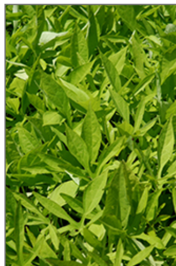
SolarPower Lime Sweet Potato Vine foliage