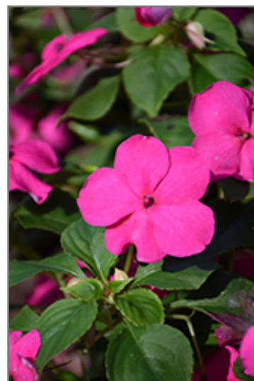
Lollipop Pomegranate Carmine Impatiens flowers

Lollipop Pomegranate Carmine Impatiens is recommended for the following landscape applications;