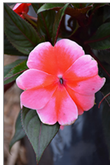
Florific Sweet Orange New Guinea Impatiens flowers

Florific Sweet Orange New Guinea Impatiens is recommended for the following landscape applications;