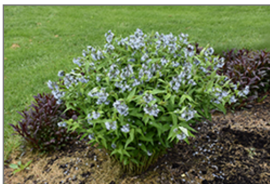
Blue Star Flower in bloom