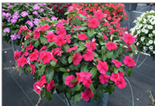
Valiant Punch Vinca in bloom