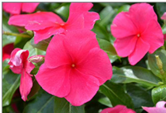
Valiant Punch Vinca flowers

Valiant Punch Vinca will grow to be about 12 inches tall at maturity, with a spread of 18 inches. Its foliage tends to remain dense right to the ground, not requiring facer plants in front. Although it's not a true annual, this fast-growing plant can be expected to behave as an annual in our climate if left outdoors over the winter, usually needing replacement the following year. As such, gardeners should take into consideration that it will perform differently than it would in its native habitat.