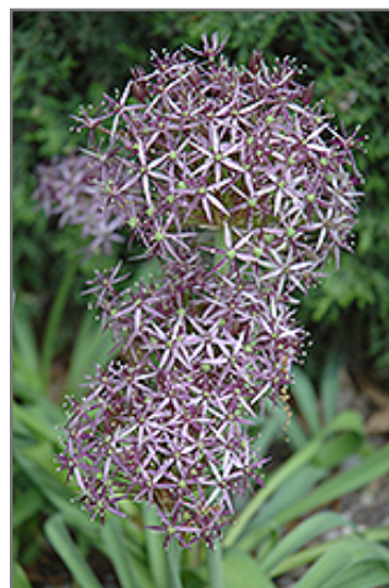
Star Of Persia Onion flowers