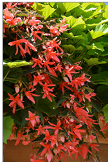
San Francisco Begonia flowers

San Francisco Begonia is recommended for the following landscape applications;